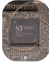
Thermocouples placed for profile development

There are two variations in the Intruder series: The Intruder Lightning model 7500-5000 has a focal Bottom Heater whereas the Intruder Marksman 7500-7500 has a Panel Bottom Heat system. Each machine has a manual component-placement arm with a final precision touch-down stage. Programming and reflow functions are identical to the Sniper series of systems.